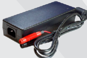
Power Source (B)