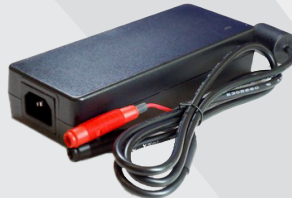
Power Source (B)